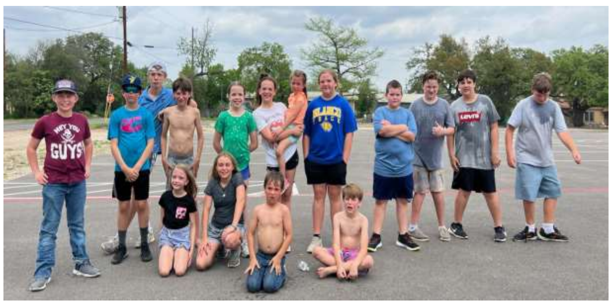
Palm Sunday—April 2<sup>nd</sup>

A delicious Pancake Breakfast was prepared and served by Trinity Youth in the fellowship hall from 8:30-9:15a.m. Freewill donations of $263 were received and deposited into the Youth Camp Account to help off-set expenses of Trinity Summer Campers, set for June 30-July 4, 2023.